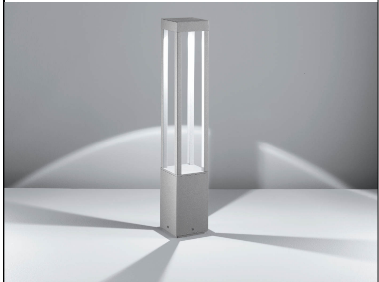
Shown above: DUS827-grey-6W-830-120V/277V-DRV