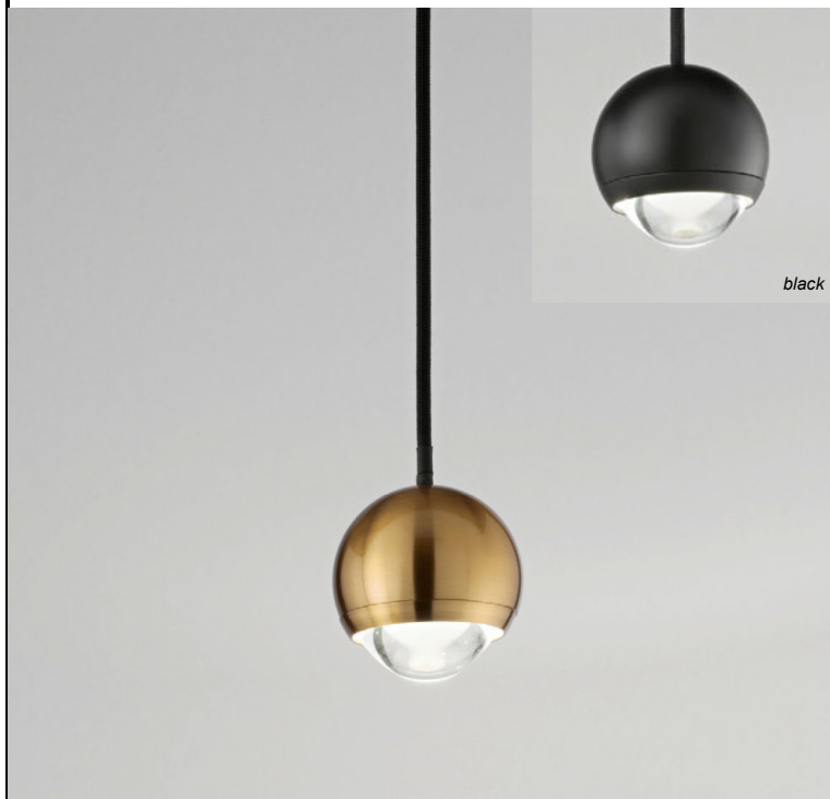
Shown above: DUS619-brass-2M-7W-827-120V-DIM